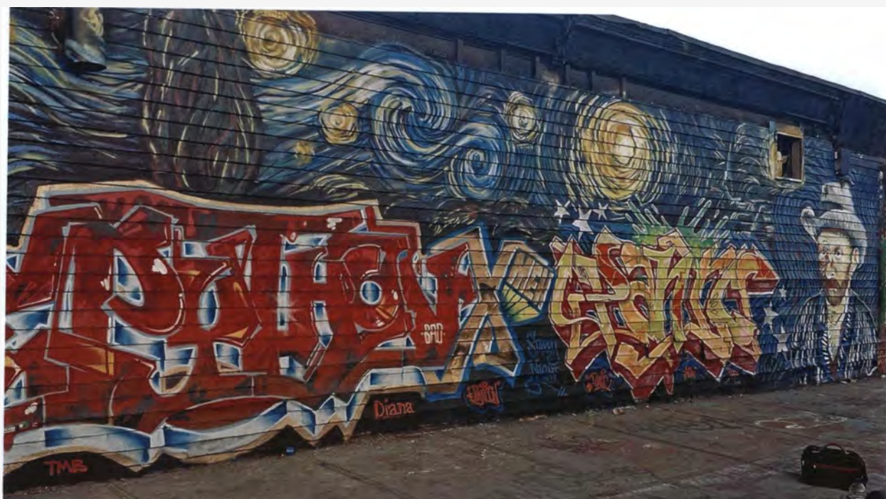
Kenji Takabayashi - Starry Night