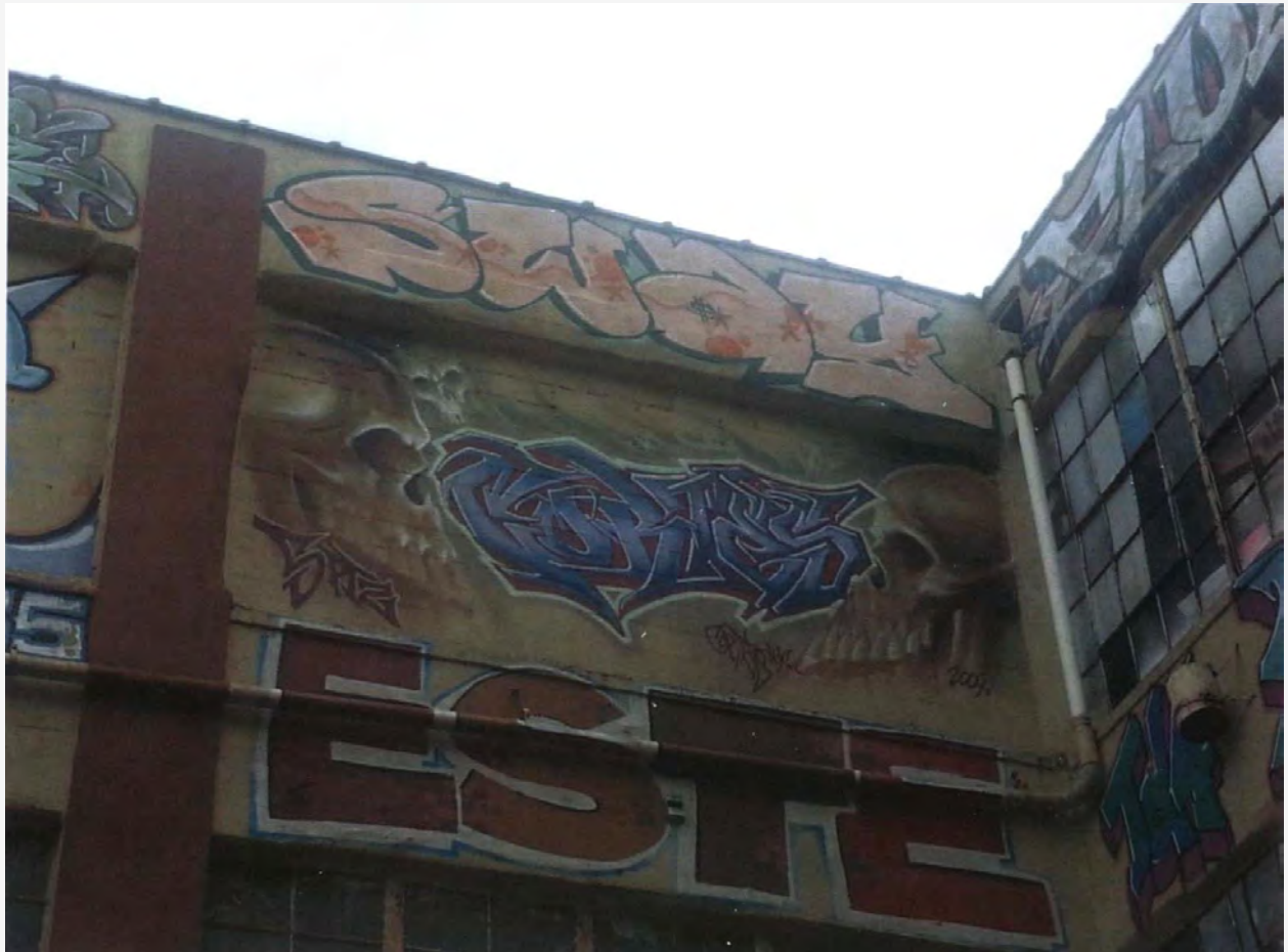
Christian Cortes - Up High Skulls