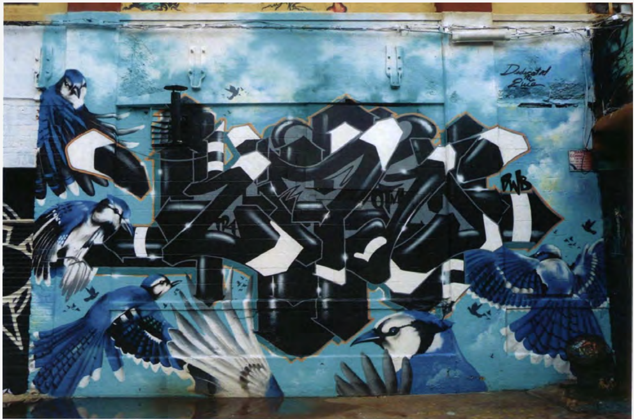
Luis Lamboy - Blue Jay Wall