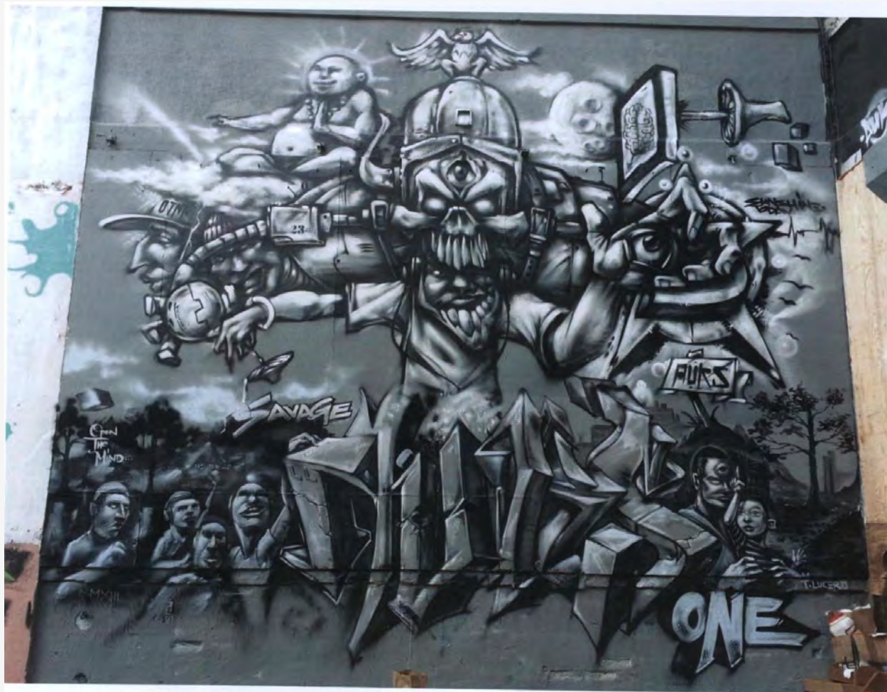
Thomas Lucero - Black Creature