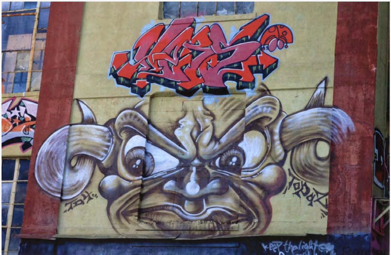
James Rocco - Bull Face