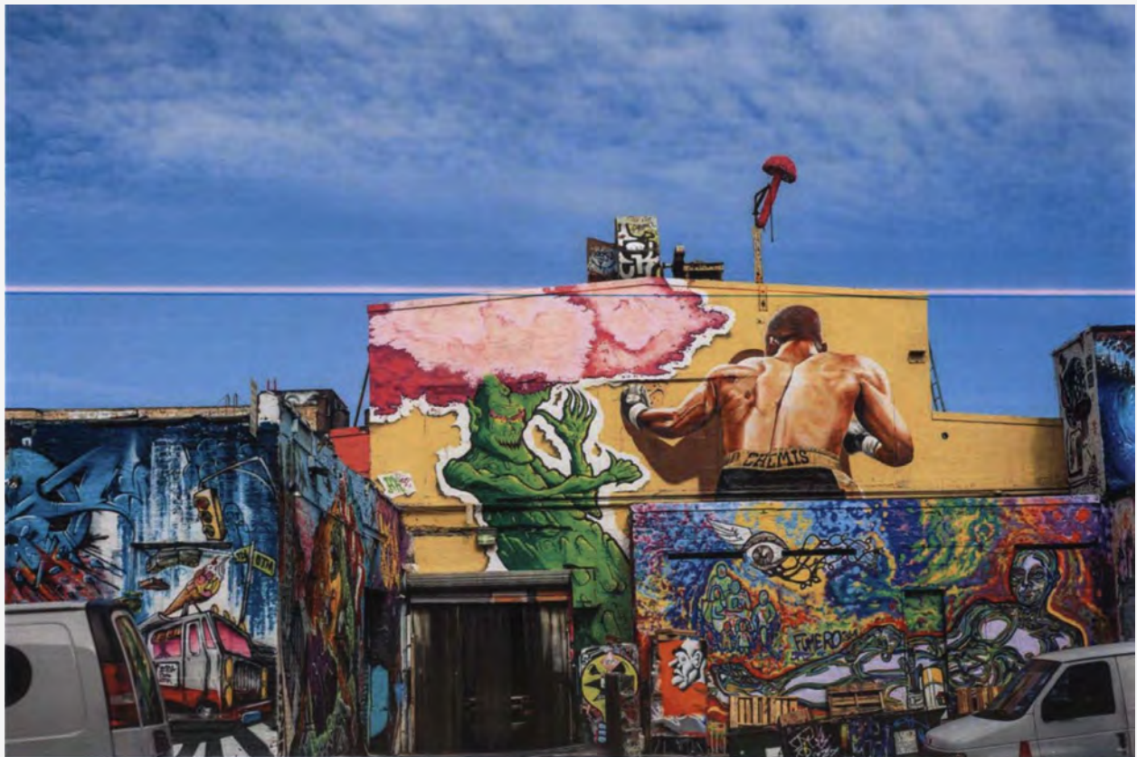
Rodrigo Henter de Rezende - Fighting Tree