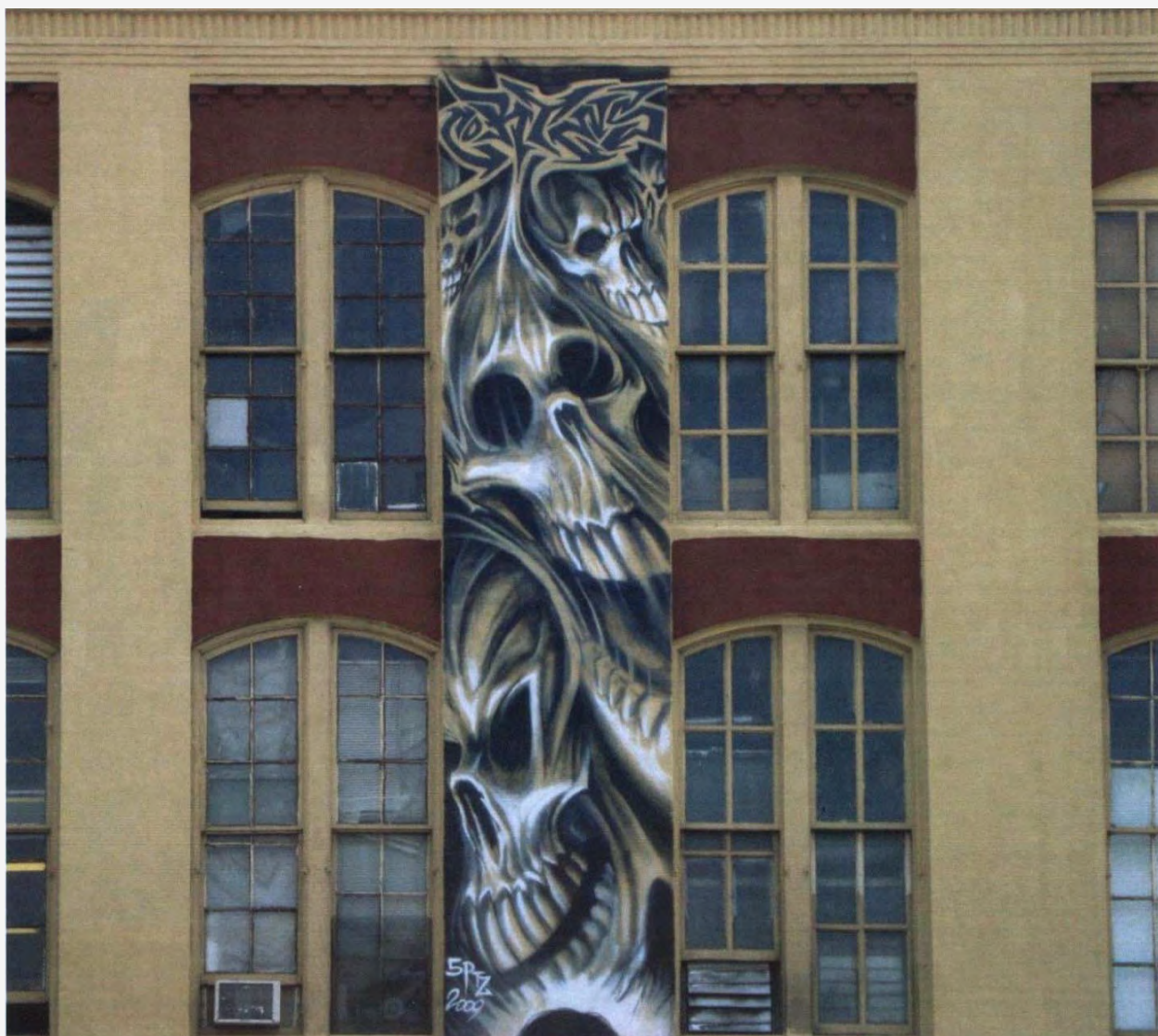
Christian Cortes - Skulls Cluster