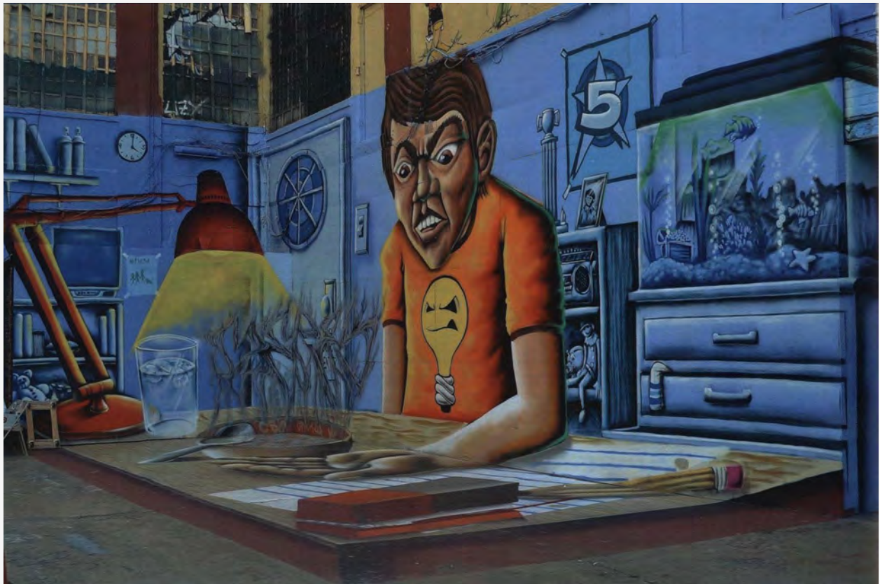
Jonathan Cohen - 7-Angle Illusion