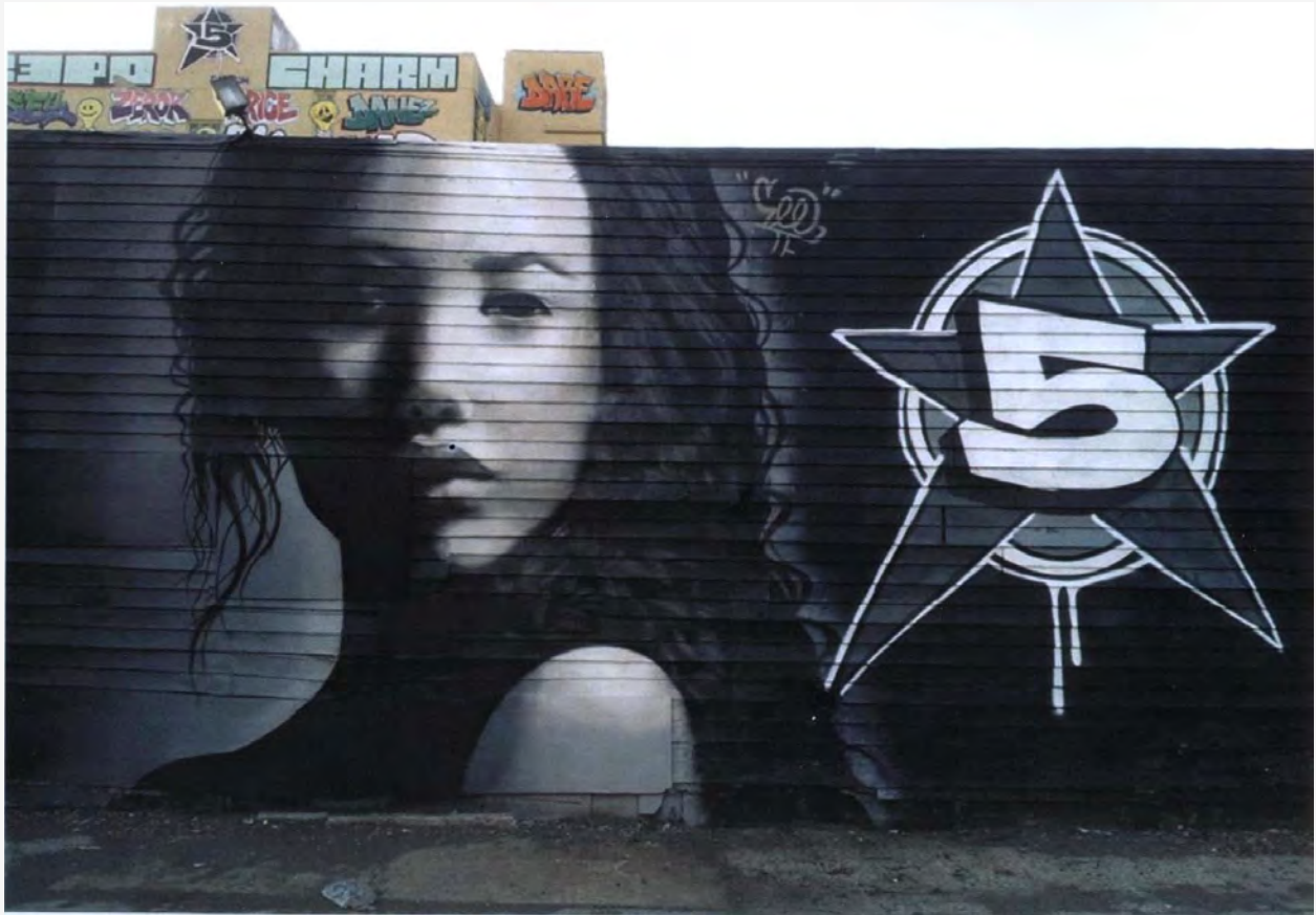
Carlos Game - Black and White 5Pointz Girl