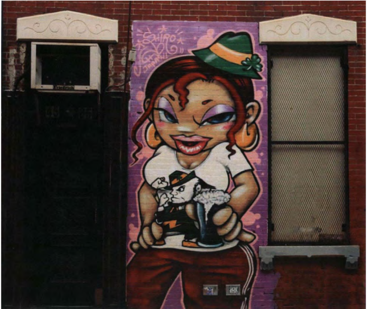
Akiko Miyakami - Japanese Irish Girl