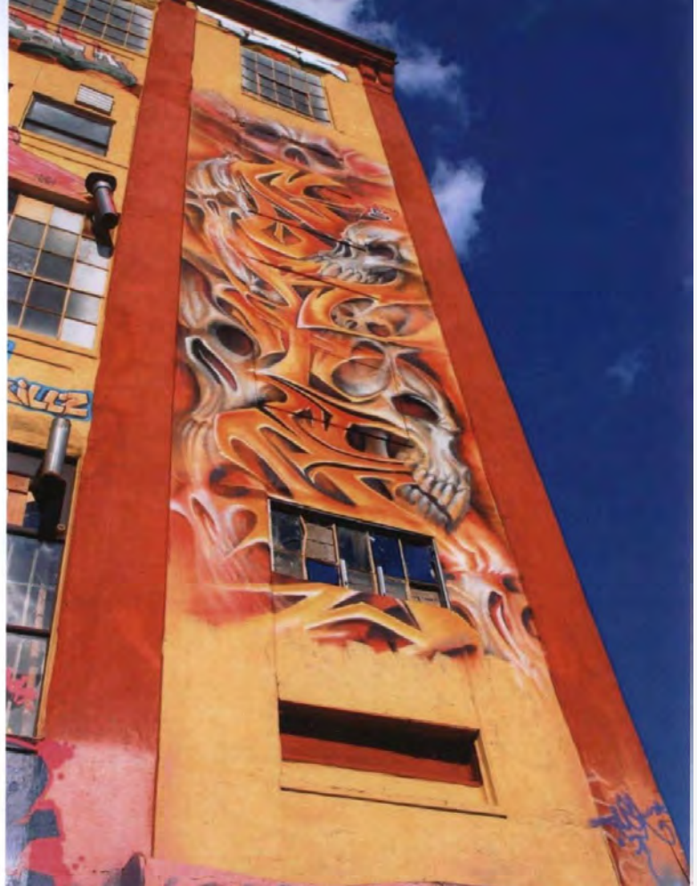
Christian Cortes - Up High Orange Skulls