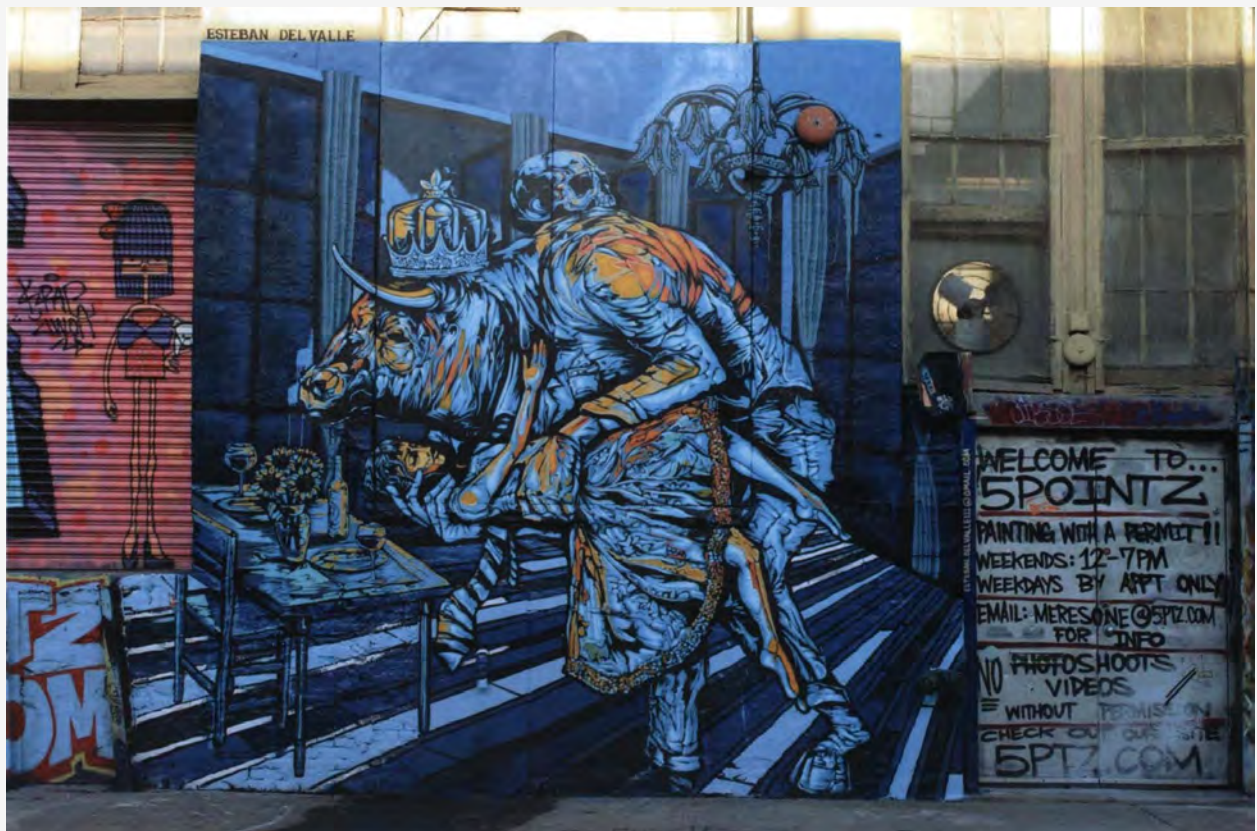
Esteban Del Valle - Beauty and the Beast