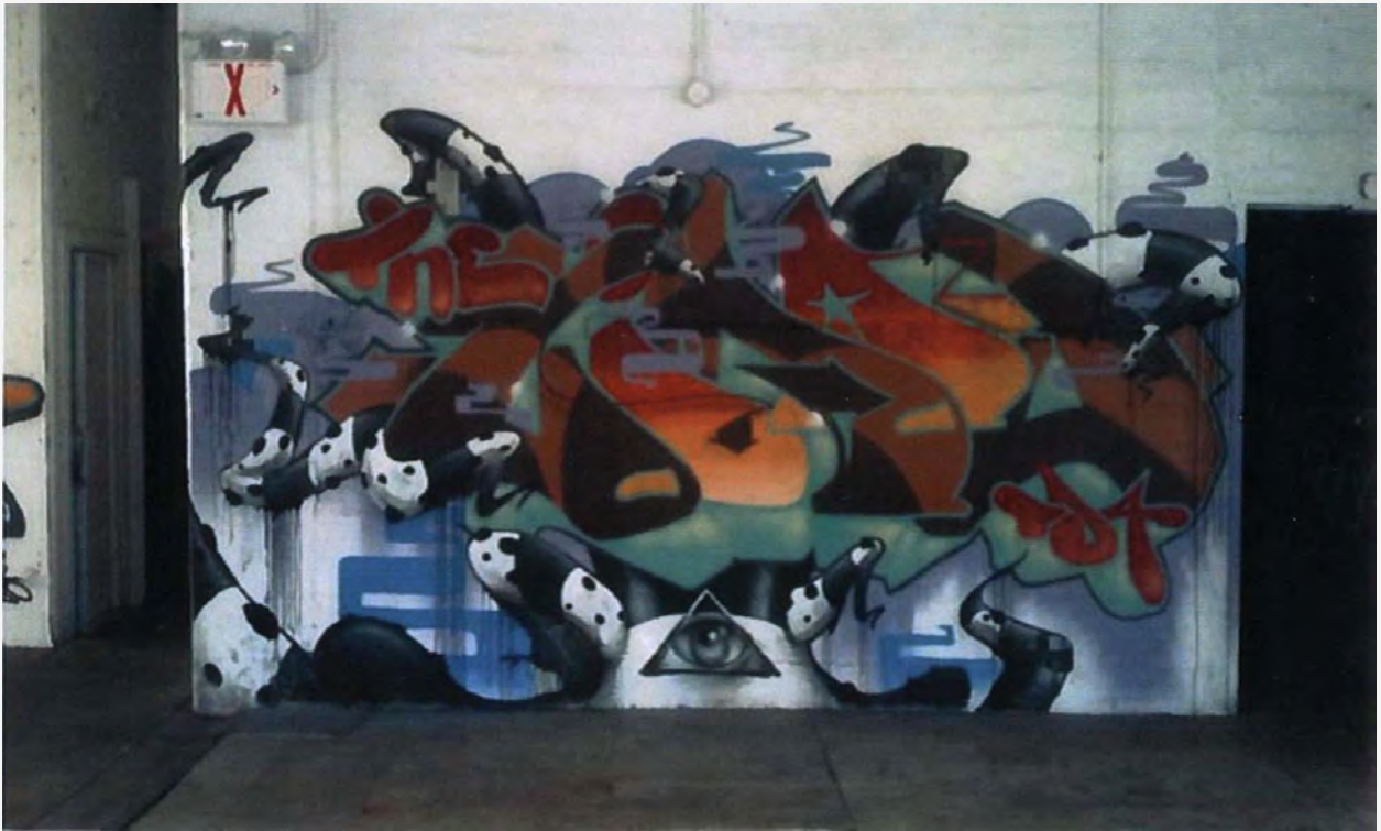
Luis Lamboy - Inside 4th Floor