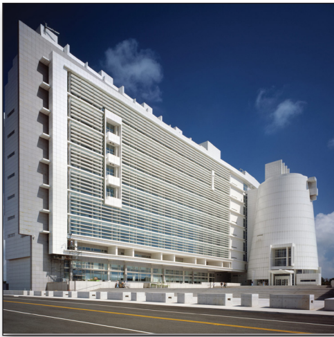
Alfonse M. D'Amato United States Courthouse 100 Federal Plaza, Central Islip, New York, 11722